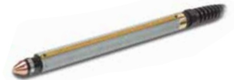
T45m machine torch