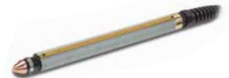
T45m machine torch