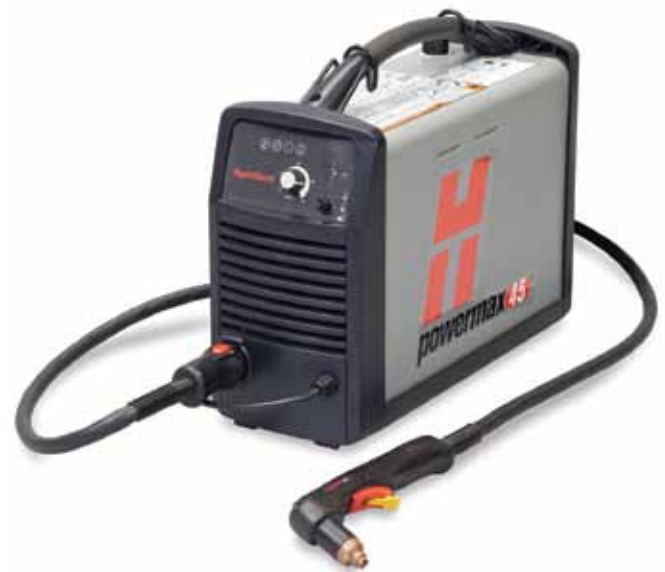
T45v hand torch