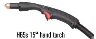
H65s 15° hand torch